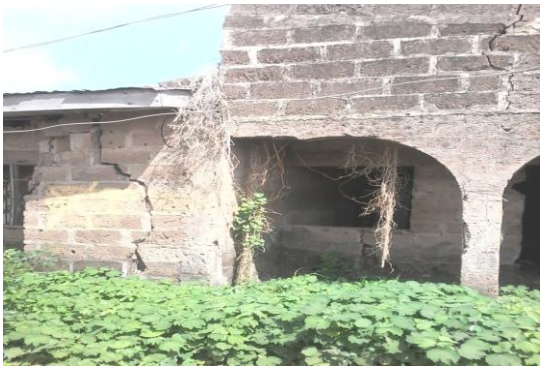
Fig. 7: Cracks on building at Gaa-Odota, Ilorin