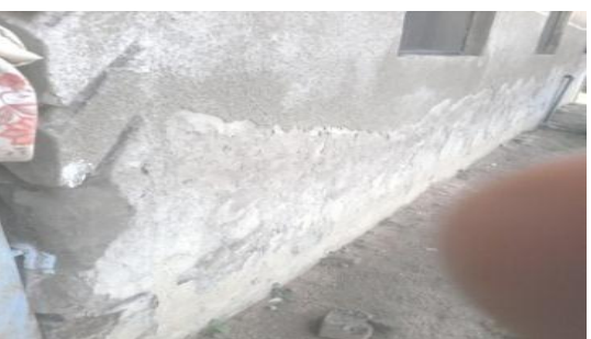
Fig. 2: Efflorescence on building at Gaa-Odota, Ilorin.