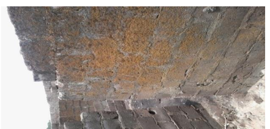
Fig. 3: Mold growth on building at Gaa-Odota, Ilorin