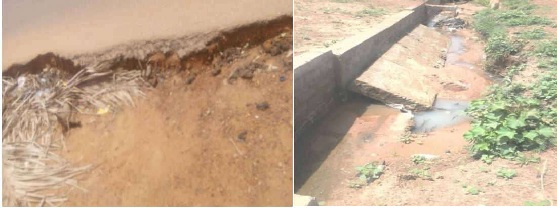
Fig. 9: Edge crack on road pavement at Gaa-Odota,Ilorin