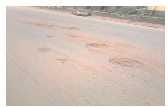
Fig. 8: Potholes on road pavement at Gaa-Odota, Ilorin

Defects on roads structures due to effect of underground water at Gaa-Odota, Ilorin