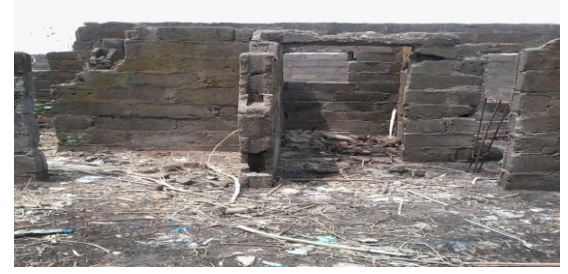
Fig. 4: Partial collapse of building at Gaa-Odota, Ilorin.